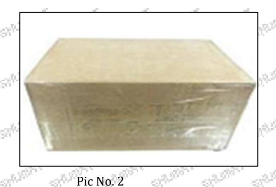
Domestic express packaging: Wrapped by Transparent tape black protective film

A Minors are prohibited from using transparent tape, yellow tape, black wrapping protective film, and white wrapping protective film to avoid personal injury. - AND 100